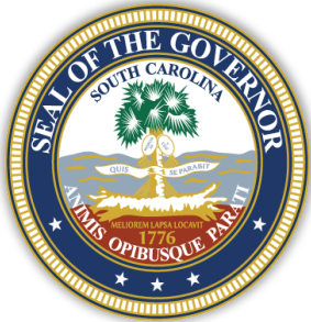
Office of the Governor Gov. Henry D. McMaster