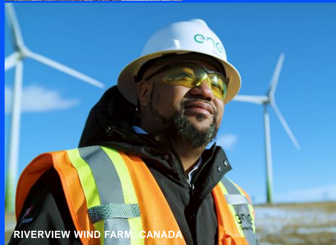
RIVERVIEW WIND FARM, CANADA