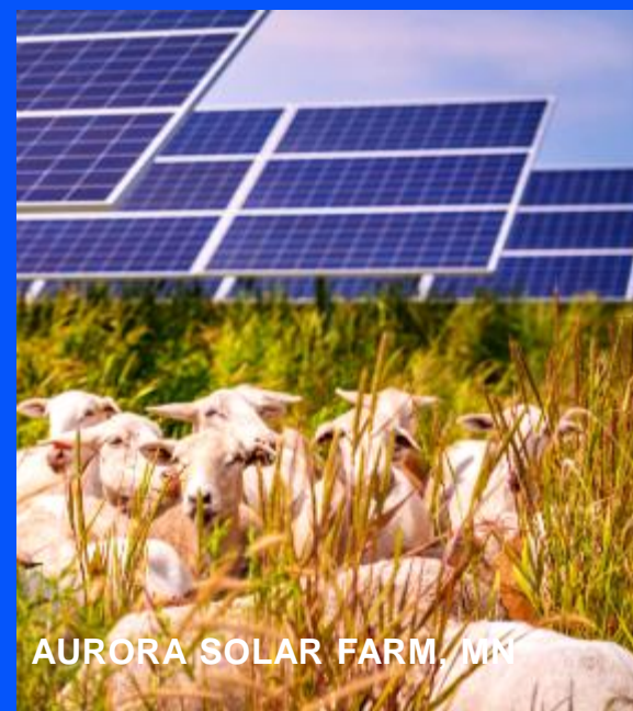
AURORA SOLAR FARM, MN