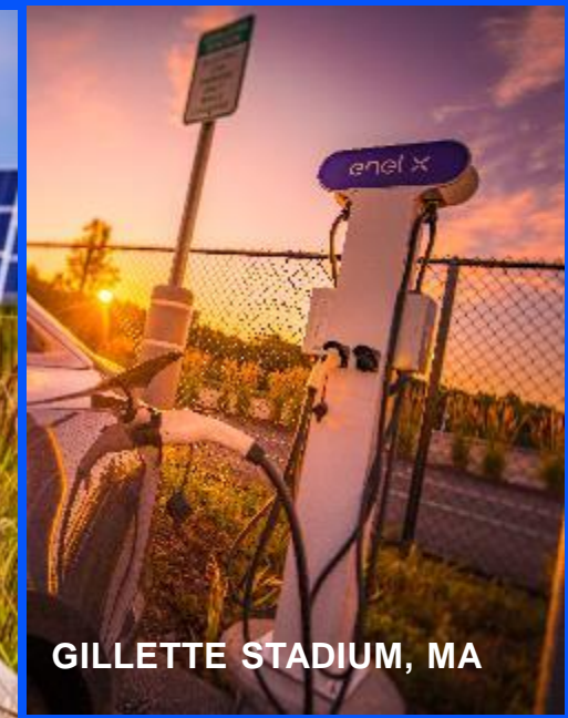
GILLETTE STADIUM, MA