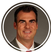
Honorable Kevin Stitt Governor of Oklahoma