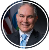
Scott Pruitt U.S. EPA