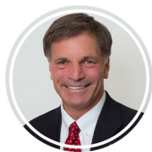
Honorable Mark Gordon Governor of Wyoming