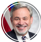
Honorable Dan Brouillette U.S. DOE