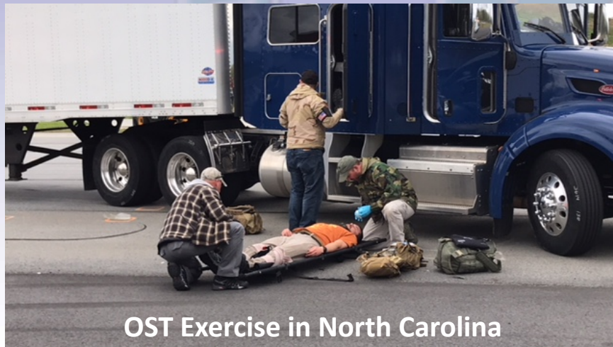
OST Exercise in North Carolina