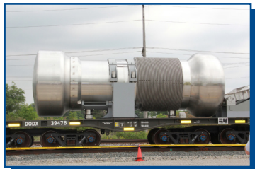
Above: The M-290 used to transport spent nuclear fuel from Navy's nuclear propelled aircraft carriers.