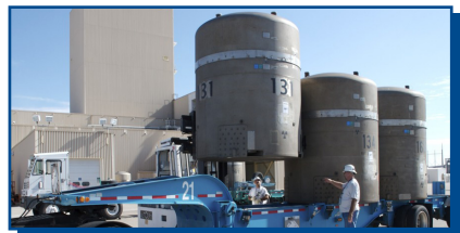
Above: An empty TRUPACT-II is loaded onto a trailer. The TRUPACT-IIs is one of several containers sent to the generator sites empty and returned with transuranic waste for disposal.