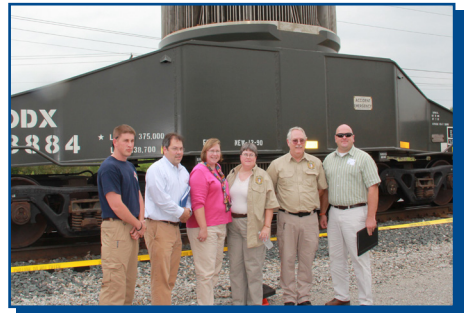
Above: Radiological health professionals representing the state of Missouri pose for a photograph in front of the M-140 Container which is used to transport spent nuclear fuel from Naval nuclear submarine reactors.