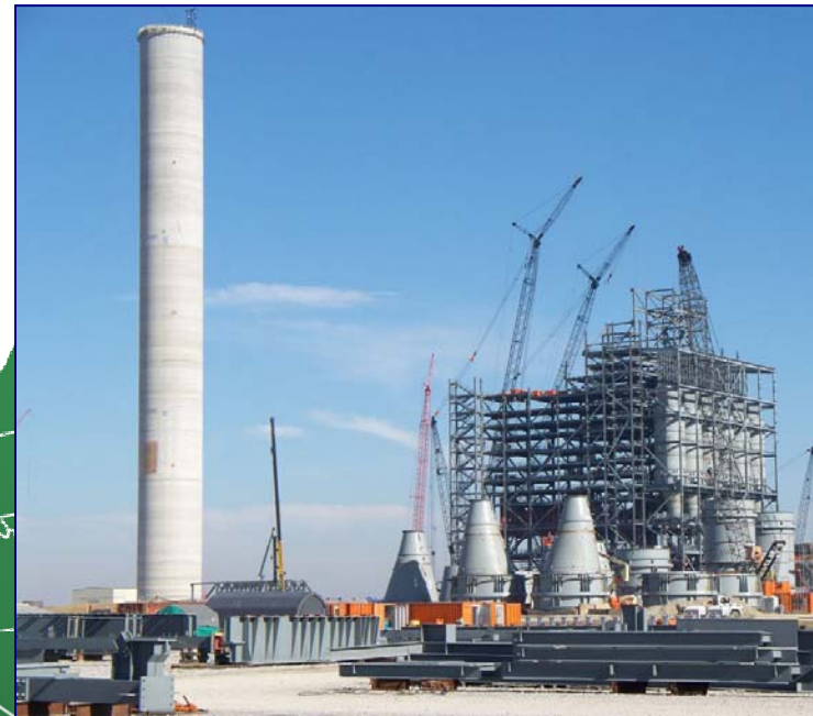
The 1,600 MW Prairie State Energy Campus under construction in Southern Illinois; startup in 2011

EIA: Coal Growth to Exceed Oil, Gas & Nuclear Growth Through 2030