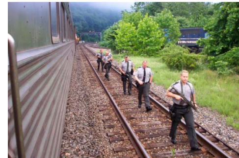
DOE/OCRWM Photo of PA police walking along side rail shipment