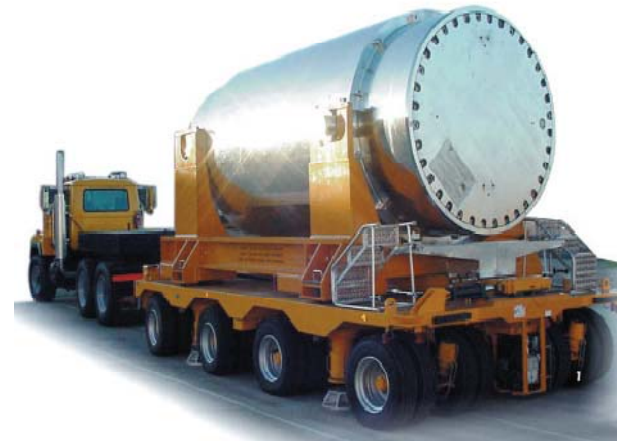
NRC photo of empty container on truck