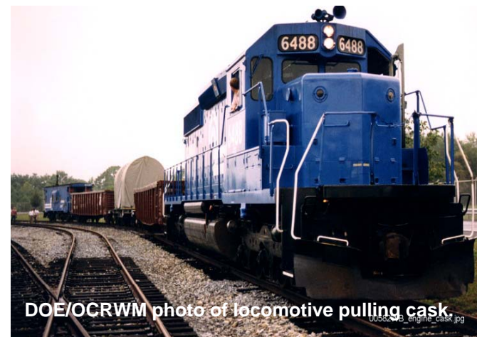
DOE/OCRWM photo of locomotive pulling cask.